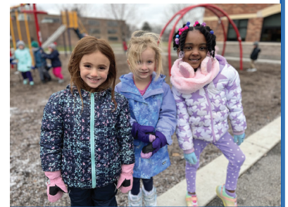
New 4th-6th Grade Playgrounds

The library and media center areas at Rogers-Southlawn and Iroquois schools will be re-imagined and renovated to provide Makerspaces and support our growing STEAM programs. In addition to reconfiguring and redesigning these program spaces, they will also be outfitted with more innovative and modernized learning tools and resources to complement our book collections.