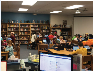
School Library Renovations